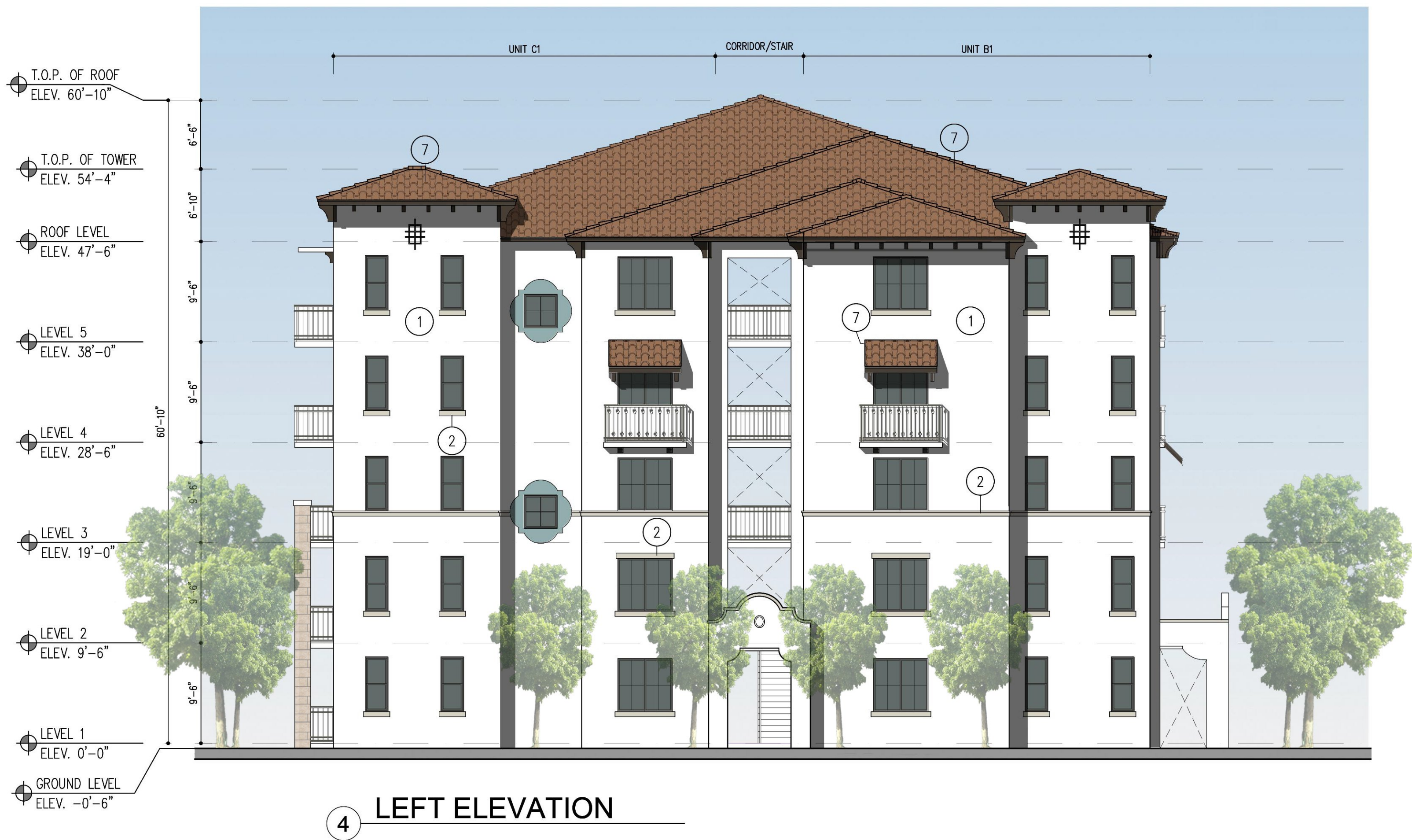
4 LEFT ELEVATION