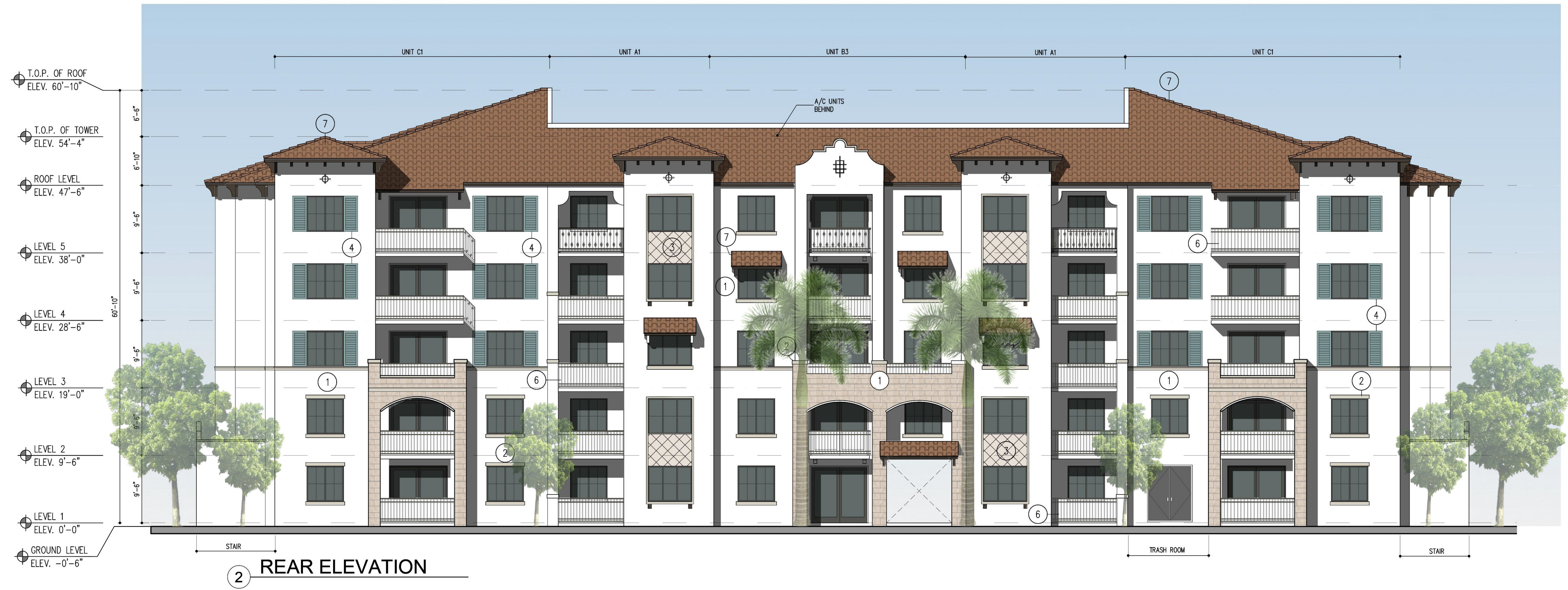
2 REAR ELEVATION